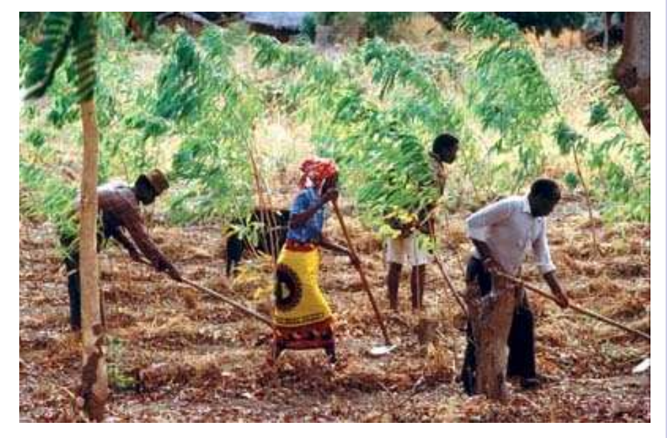
Malawian farmers managing their agricultural resources.