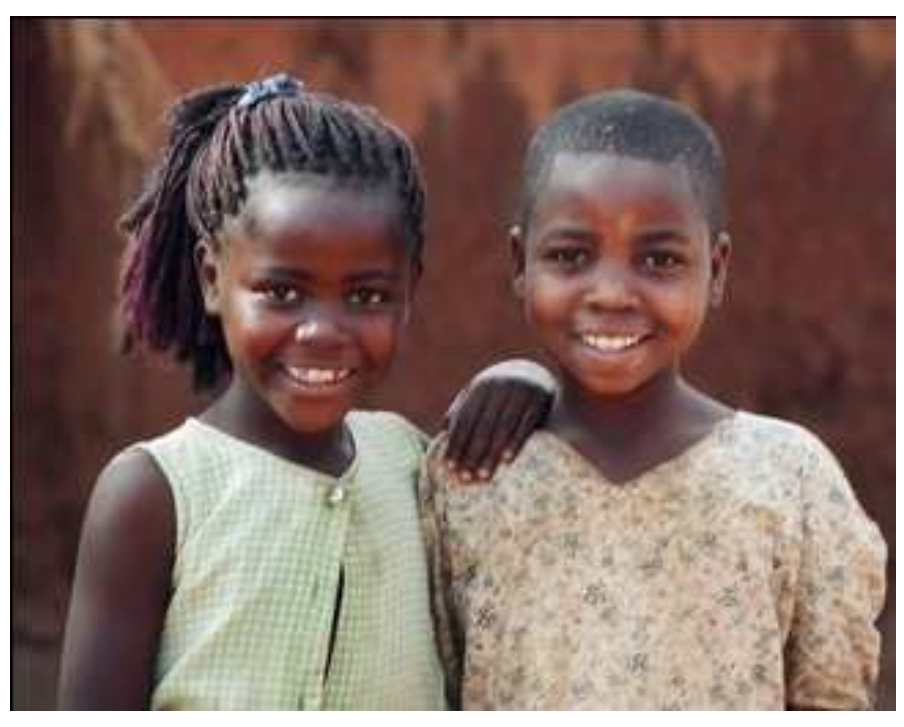
Poverty threatens the human rights of young girls in Malawi

sufficient programmes for the physical and psychological recovery and social reintegration of child victims of such abuse and exploitation.