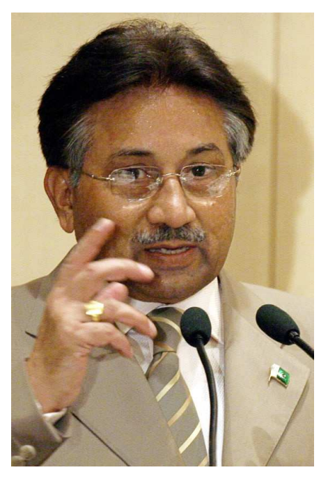
Ex-Pakistani President Musharraf

Most importantly, Pakistan has been unable to make a human rights policy in the country. Nor has it made efforts to develop any mechanism for implementation of the commitments under the International human rights treaties and inde-